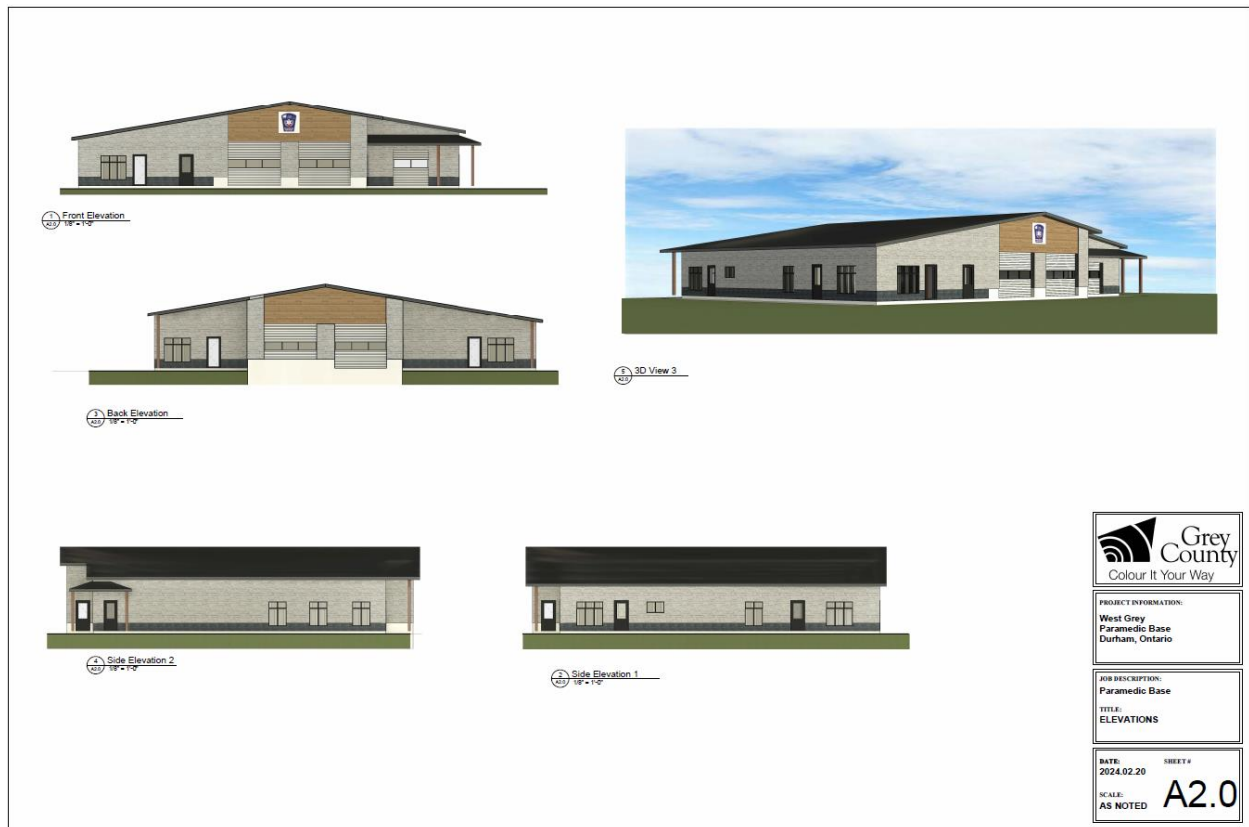
Figure 2 – Draft Elevation Drawings of Proposed Durham Paramedic Base