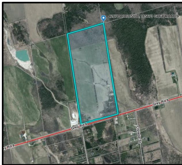
Figure 1: Aerial map of the subject lands

Figure 1 below shows an aerial view of the subject lands highlighted in blue and the surrounding land uses.