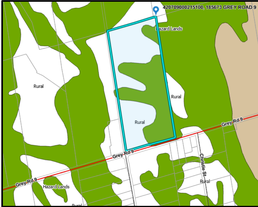
Figure 2: Schedule A Land Use Designations, County Official Plan

The applicant is seeking to expand the storage areas associated with the existing lumber yard, including adding more outdoor storage as well as an open-air, covered storage structure, to meet current and anticipated demands and inventory, and continue successful operation of the OFDU. The expansion would result in increasing the overall area of the OFDU, inclusive of buildings, laneways, and outdoor storage areas, by 1,300 m 2 . The outdoor storage area would continue to be located beside and towards the rear of the OFDU area, which will result in less visual impact from the County Road and neighboring properties. The proposed covered storage area is also proposed to be located in a previously disturbed area behind the existing shop.